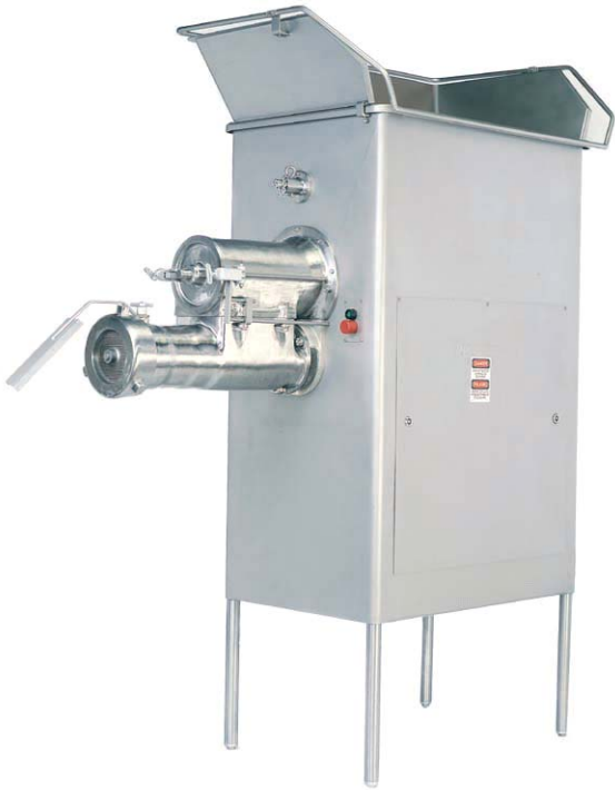
Butcher Boy Grinder