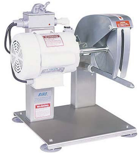
Biro BCC-100 Poultry Cutter