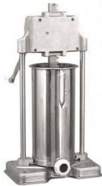
Sausage Stuffers 25 lb Deluxe (40040)