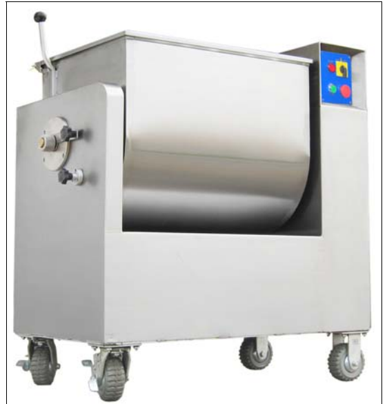
Mixers: MM-100, MM-140, MM-200, MM-300