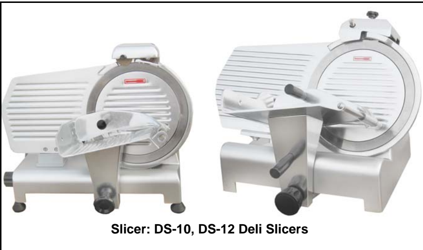
Slicer: DS-10, DS-12 Deli Slicers