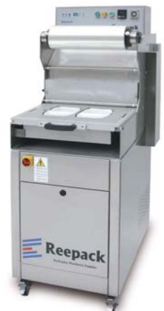
Reetray 25FS TC