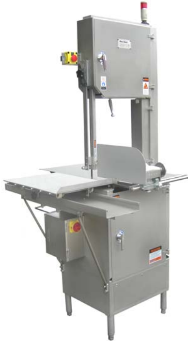
Pro-Saw SS-16 Meat Bandsaws