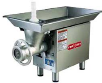
Grinder: M22-R1, M22-R2 (36010), (36012)