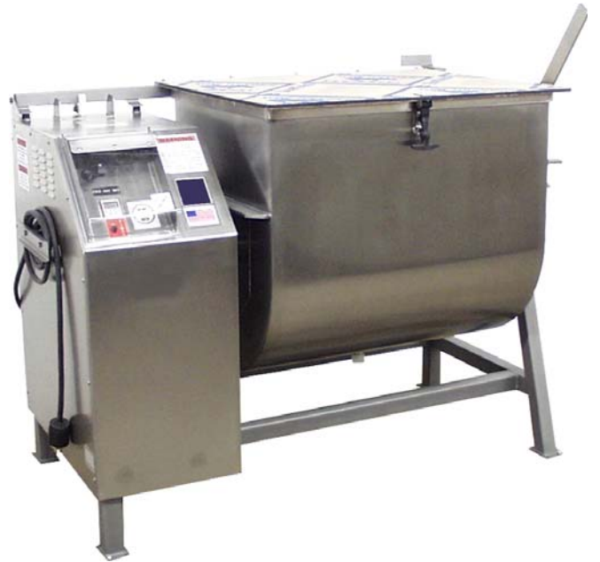
MixMaster Mixer / Blender