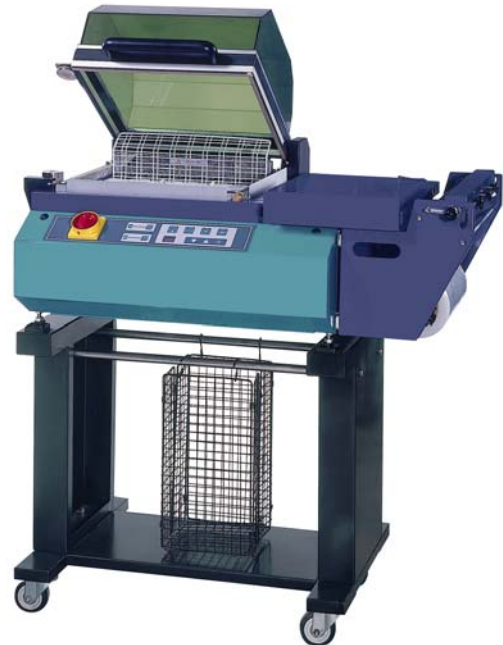
EKH - 238