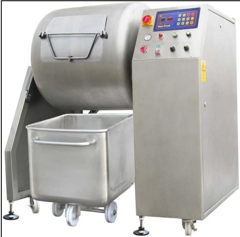
Tumbler: VariVac VV-150 VV-300 VV-500