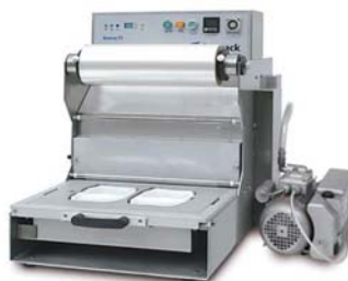
Reetray 25 FS