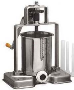
Sausage Stuffers 15 lbs (40036)