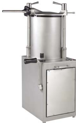
StuffMaster Hydraulic Piston Stuffers (40028)