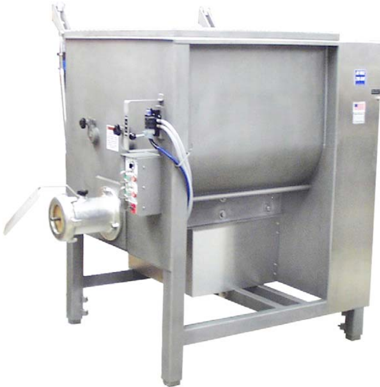
MixMaster MG-400, MG-600, MG-800 Mixer Grinder