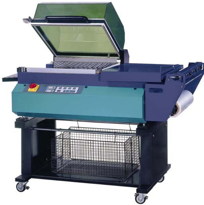
EKH - 455