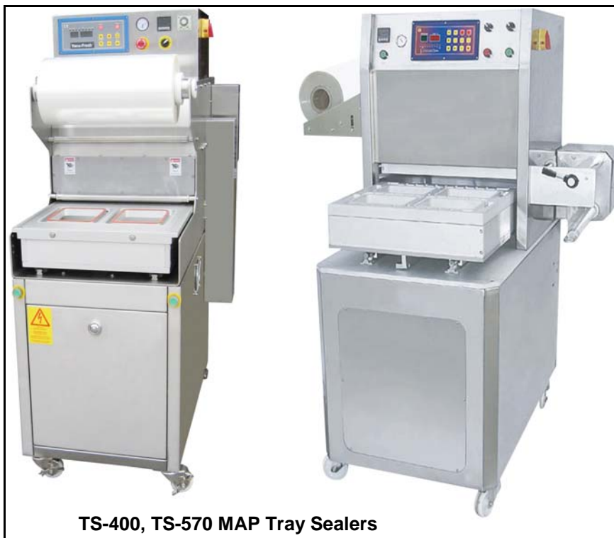
TS-400, TS-570 MAP Tray Sealers