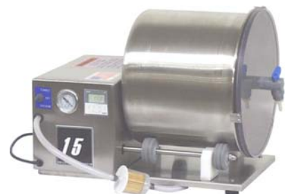
Tumbler: VariVac 15 Vacuum Tumbler (36709)