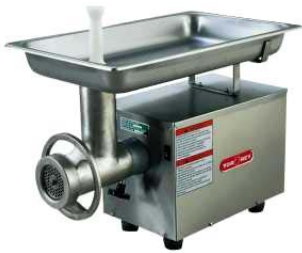
Grinder: M12-FS (36003)