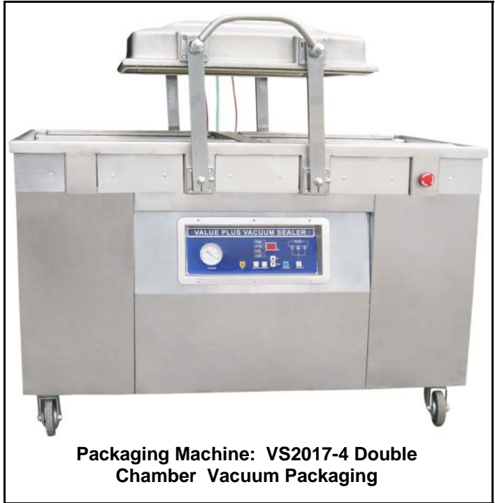
Packaging Machine: VS2017-4 Double Chamber Vacuum Packaging