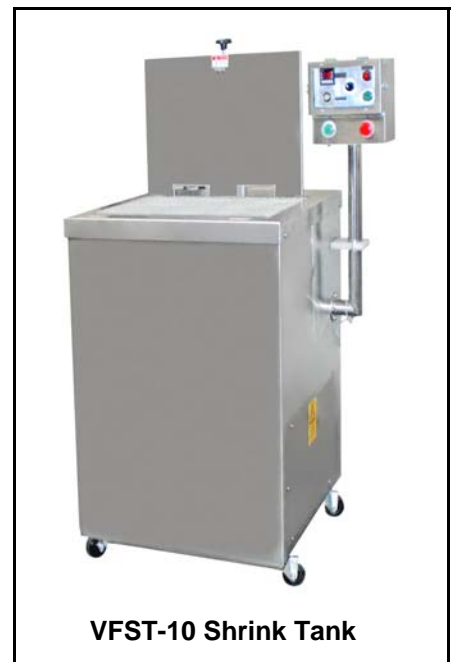
VFST-10 Shrink Tank