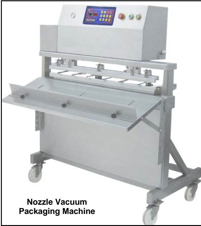
Nozzle Vacuum Packaging Machine