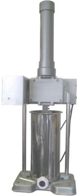
Sausage Stuffers 25 lb Motorized (40040-02)