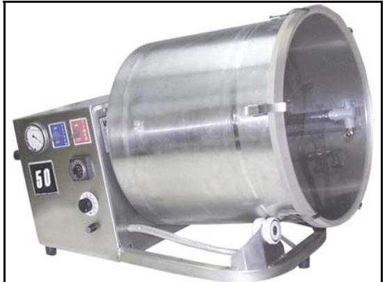
Tumbler: VariVac 50 Table-Top Vacuum Tumblers (36713)