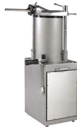
StuffMaster Hydraulic Piston Stuffers (40004, 40027)