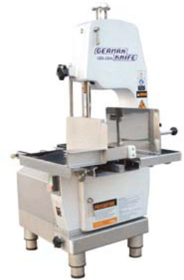
GBS 230A Meat Bandsaws