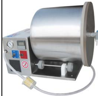
Tumbler: VariVac Vacuum Tumbler Dual Action