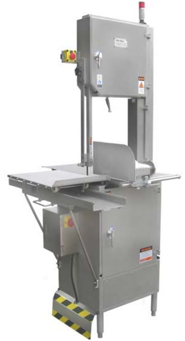
Pro-Saw SS-16 HS High-Speed Meat Band Saw