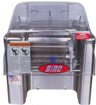
Biro Pro-9 Meat Tenderizers