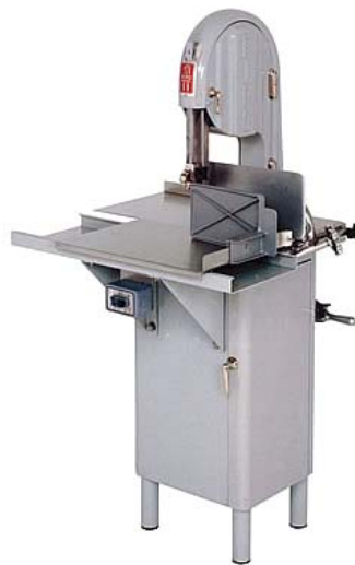
Biro 22 Band Saw