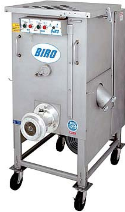
Biro AFMG 48 Mixer Grinder