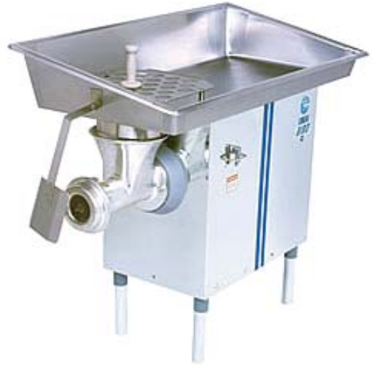
Biro Meat Grinder