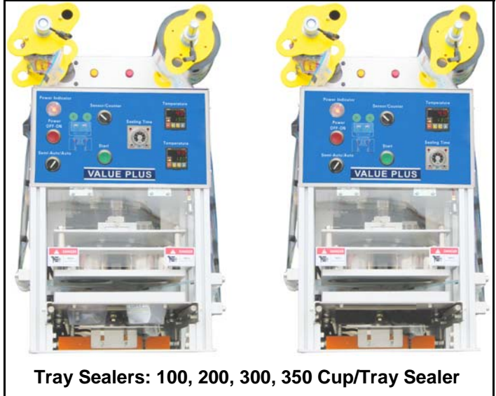
Tray Sealers: 100, 200, 300, 350 Cup/Tray Sealer