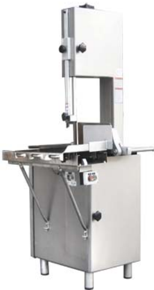
Torrey ST-305 SH Meat Bandsaws