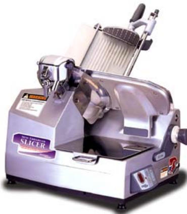
Automatic Meat Slicer: GS-12A (35828)