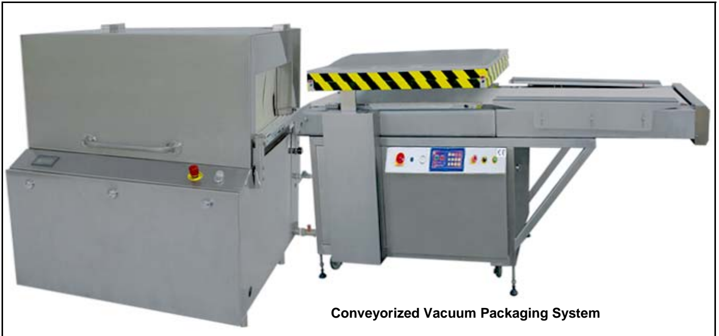
Conveyorized Vacuum Packaging System