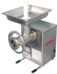
Grinder: Mini 12-FS (36002)