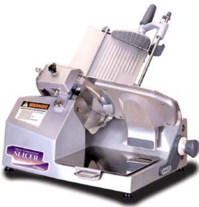
Manual Meat Slicer: GS-12M (35825)