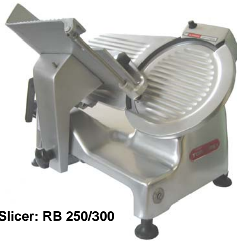
Slicer: RB 250/300