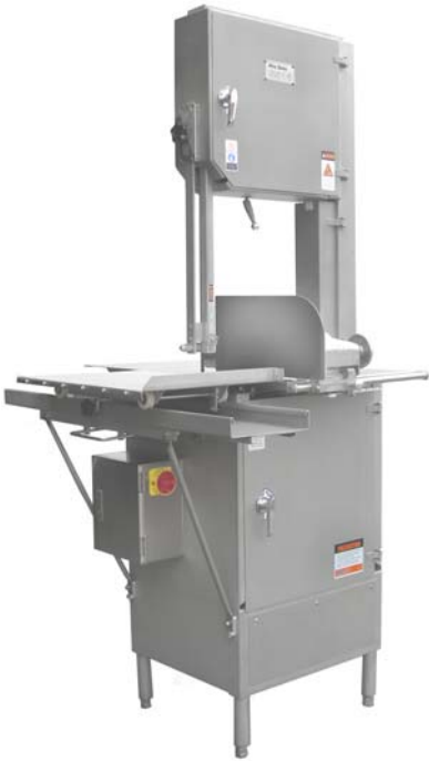
Pro-Saw SS-16E Meat Bandsaw