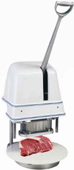
NT25 Manual Tenderizer