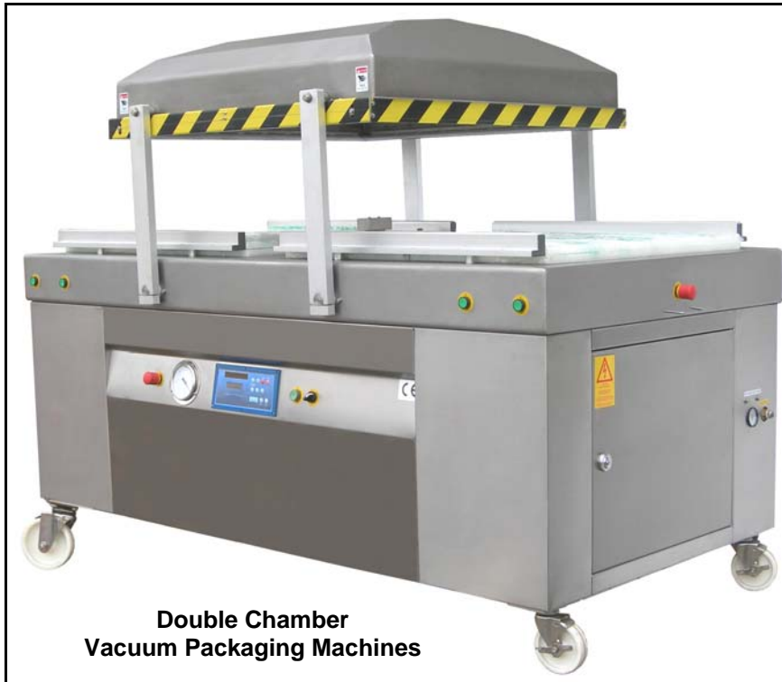
Double Chamber Vacuum Packaging Machines