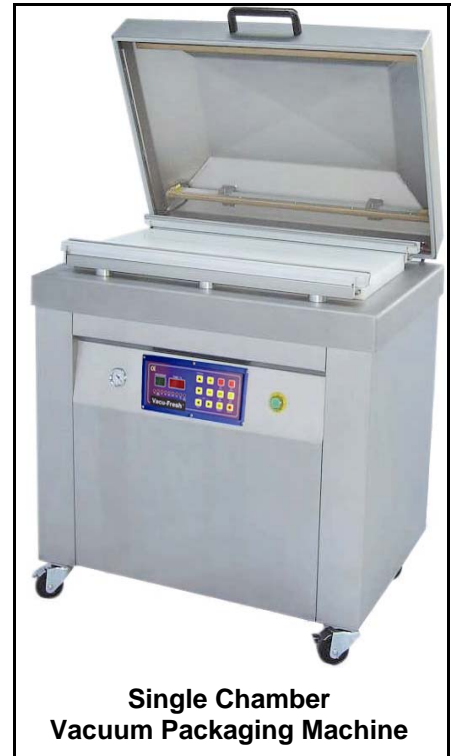
Single Chamber Vacuum Packaging Machine