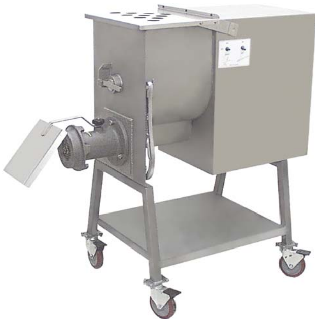
MixMaster MG-50 Mixer Grinder