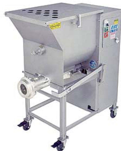
Biro AFMG 24 Mixer Grinder