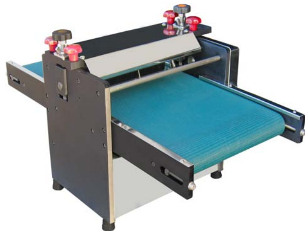
Pro-Slice TT-400 Tenderizer