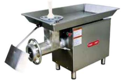
Grinder: M32-3PH (36006)