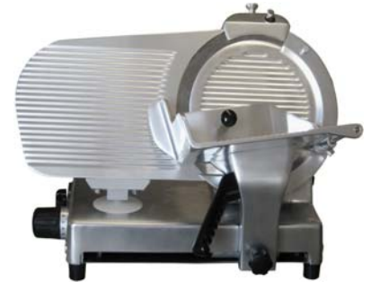
Manual Light-Duty Slicer: GS-12E (35824)