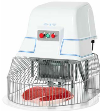
NT1500 Meat Tenderizer