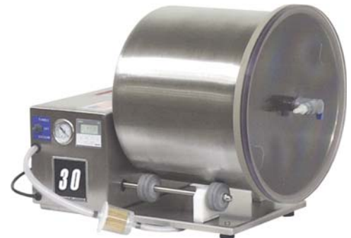
Tumbler: VariVac 30 Vacuum Tumbler (36711-02)