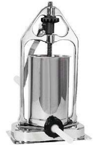
Sausage Stuffers 5 lb (40035)