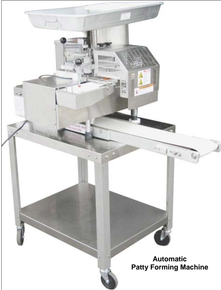
Automatic Patty Forming Machine