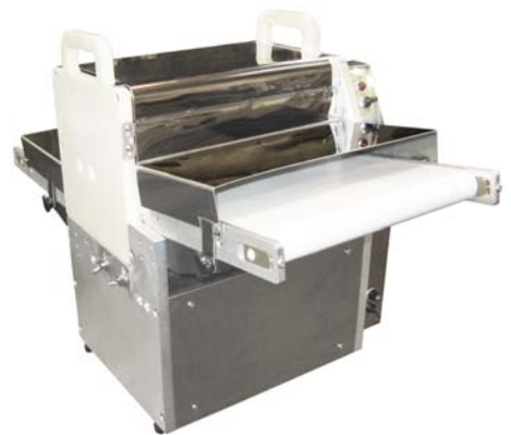
Pro-Slice SC-300 Strip Cutter