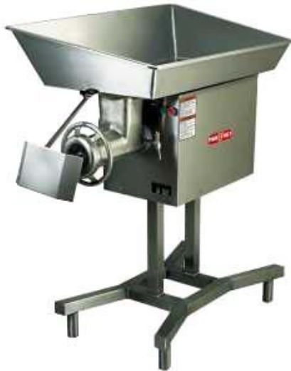
Grinder: M32-5PH (36008)