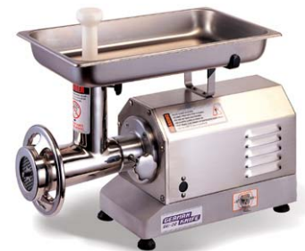
Meat Grinder : GG-22 (36020)