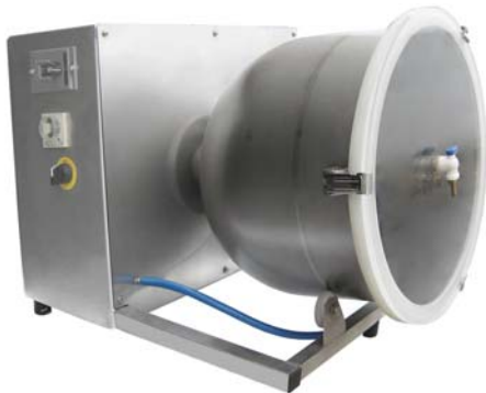
Tumbler: VariVac VV-20 VV-40 Table Top Marinating Vacuum Tumblers