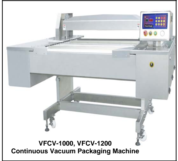
VFCV-1000, VFCV-1200 Continuous Vacuum Packaging Machine