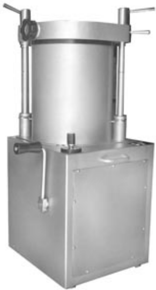
StuffMaster Hydraulic Piston Stuffers (40029)