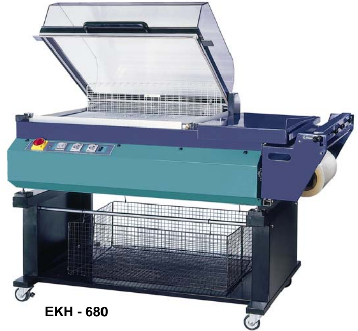
EKH - 680