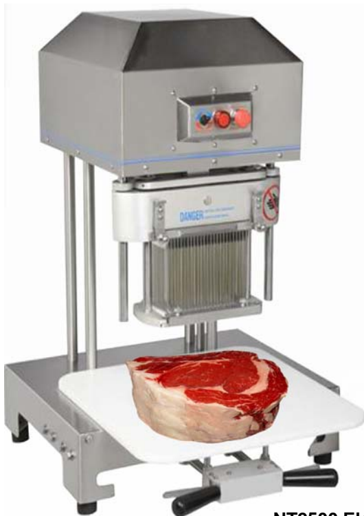
NT2500 Electric Meat Tenderizer