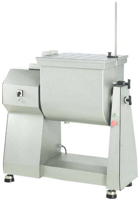
MixMaster Paddle Blender