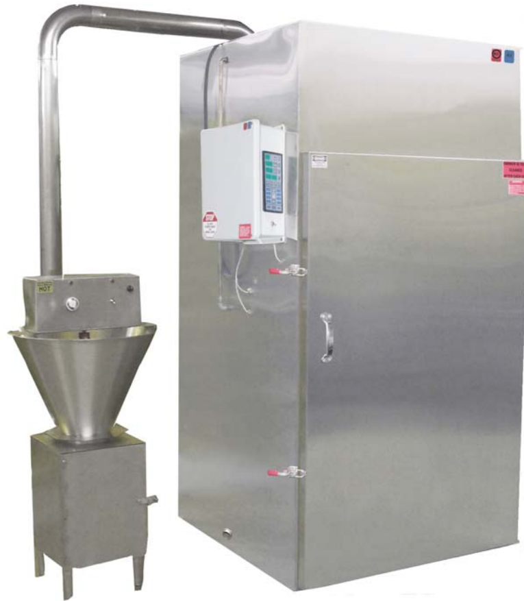
Smokehouse pictured with options.