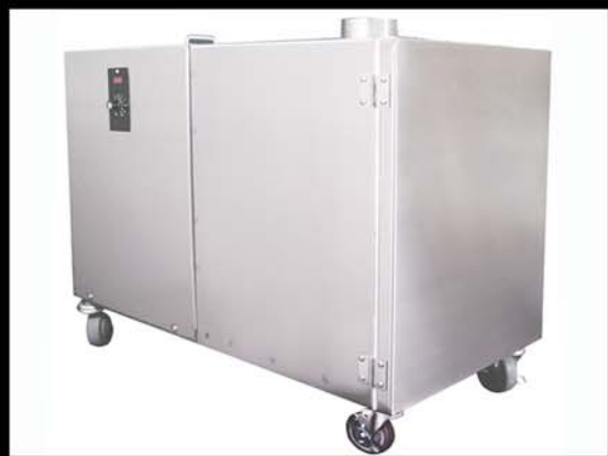
Pellet Smoke Generator