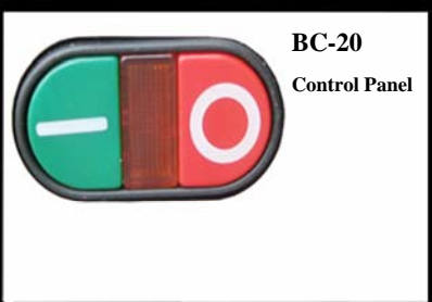
BC-20 Control Panel