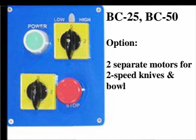
BC-25, BC-50 Option: 2 separate motors for 2-speed knives & bowl