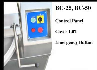
BC-25, BC-50 Control Panel Cover Lift Emergency Button