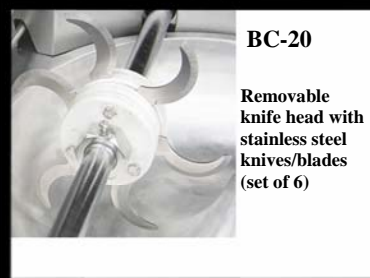
BC-20 Removable knife head with stainless steel knives/blades (set of 6)