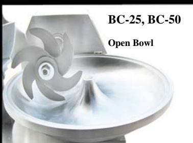
BC-25, BC-50 Open Bowl