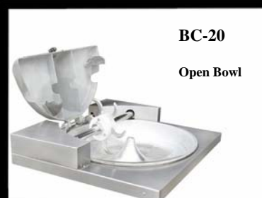
BC-20 Open Bowl