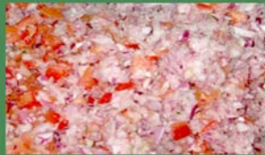
TOMATO & ONION