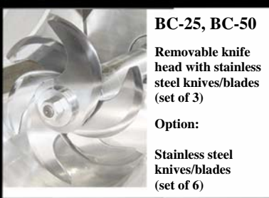
BC-25, BC-50 Removable knife head with stainless steel knives/blades (set of 3) Option: Stainless steel knives/blades (set of 6)